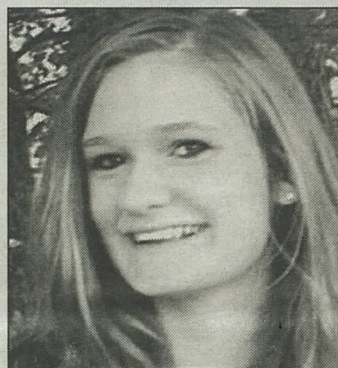
Chelsea Urban Fair Queen Contestant